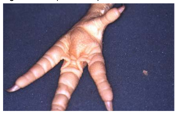
Figure 2: Example of a foot pad with Score 1

Figure 1: Example of a foot pad with Score 0