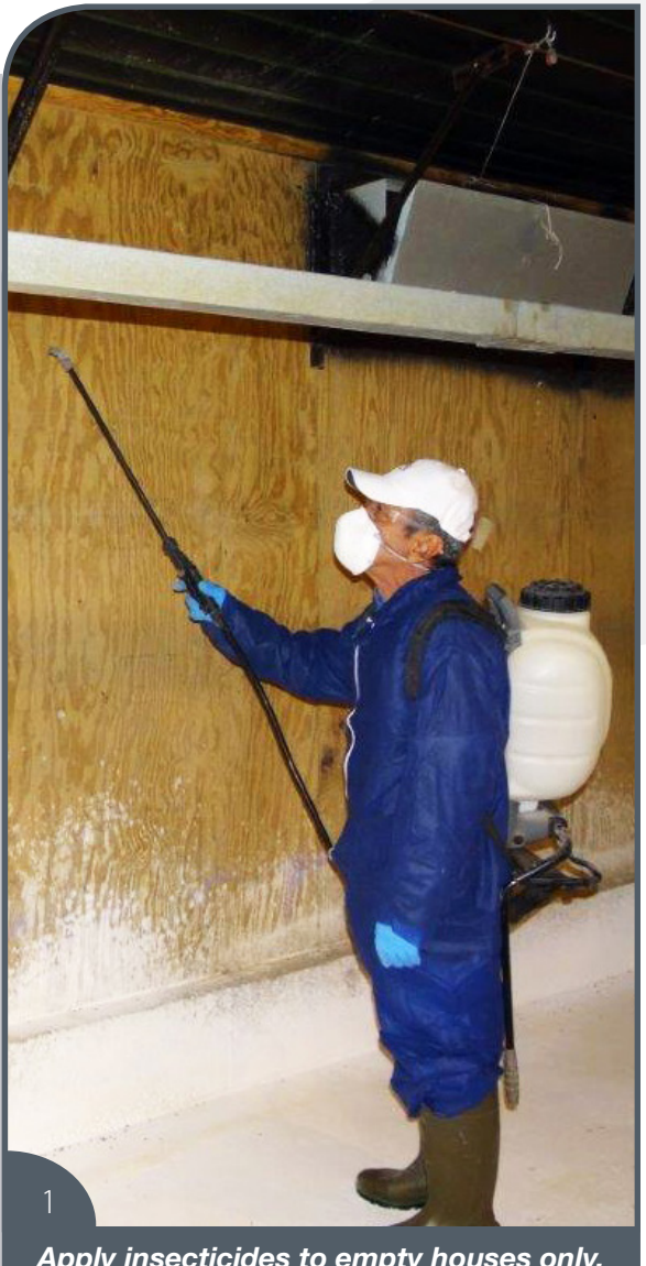
Apply insecticides to empty houses only.